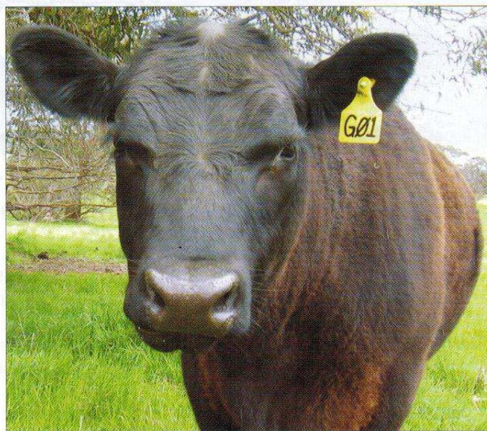
Lowline cattle are easy to handle and produce quality beef.